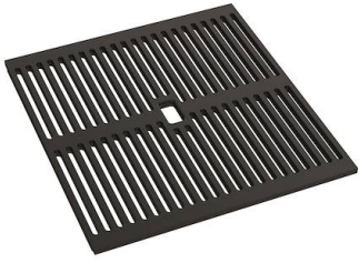
Black grid 8100 618